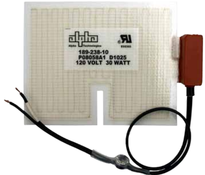
Battery Heater Pad